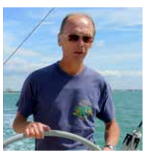
I am looking forward to the programme of talks and other entertainments which will brighten up our winter evenings.